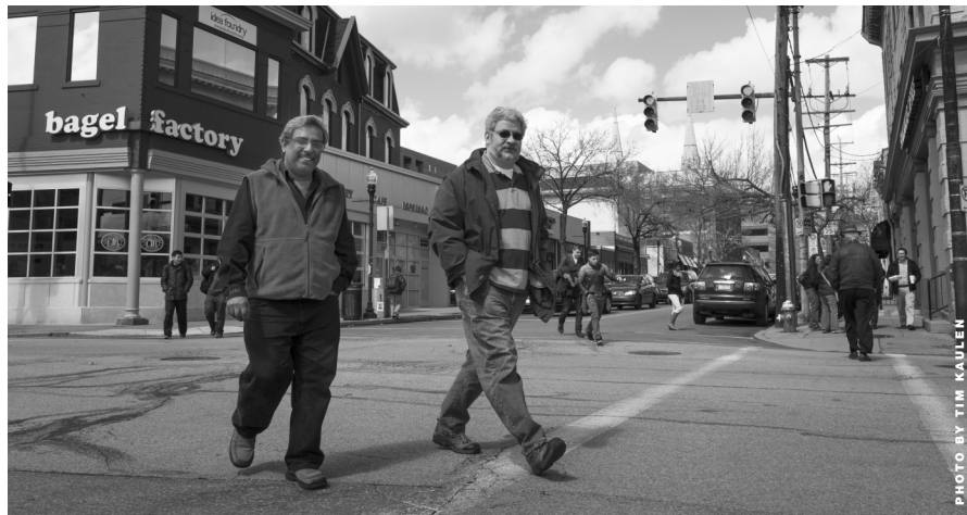
CRAIG STREET IS AMONG LOCATIONS EYED FOR FUTURE UNIVERSITY GROWTH AND DEVELOPMENT.

The 10 principles, which will be up for adoption by the Board of Trustees at its May meeting, cover the areas of building, community context, space and movement.