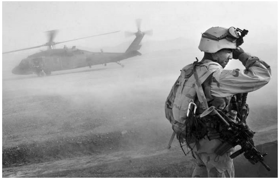
A STILL FROM "IN SERVICE: PITTSBURGH TO IRAQ" HELPS TELL THE STORY OF PERSONAL EXPERIENCES IN WAR.

"You really don't know what life is like until you're in a gunfight," says one