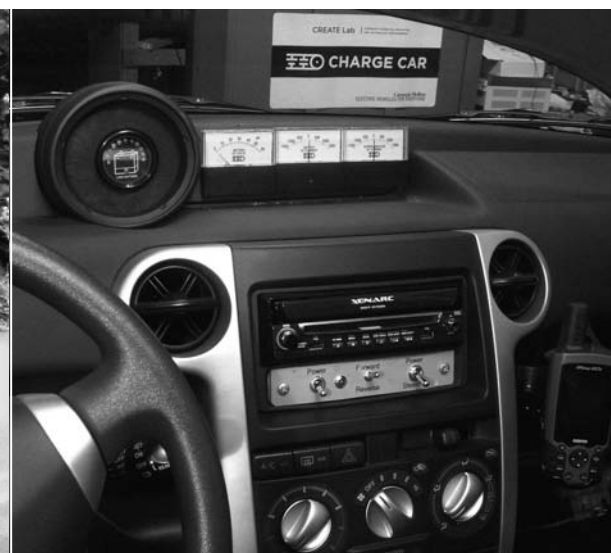
THE CHARGE CAR TEAM USED SMART POWER MANAGEMENT ARCHITECTURE TO CONVERT A 2001 SCION xB FROM GAS TO ELECTRIC.

The site also can calculate how much wear and tear on batteries could be saved by using a supercapacitor, part of a “smart power management” architecture that is key to the ChargeCar project. Unlike batteries, supercapacitors can charge and discharge at very high currents and thus can improve the vehicle’s responsiveness, while reducing the charge/discharge cycling that shortens battery life.