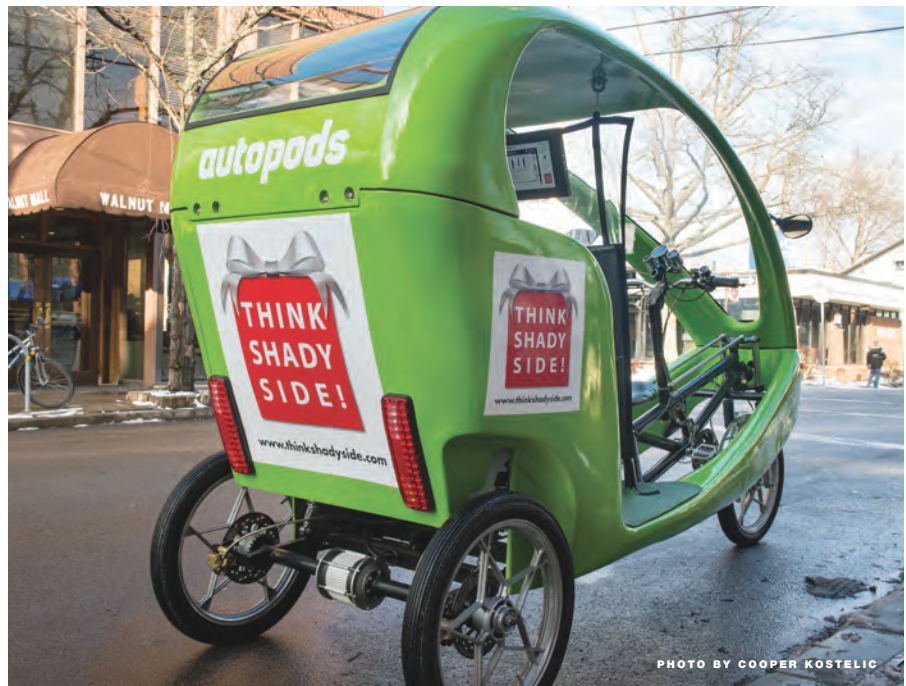
Color exterior ads on the Autopods are $850 a month.

iPad video ads run $150 per month; black and white exterior ads are $650 per month; and color exterior ads are $850 per