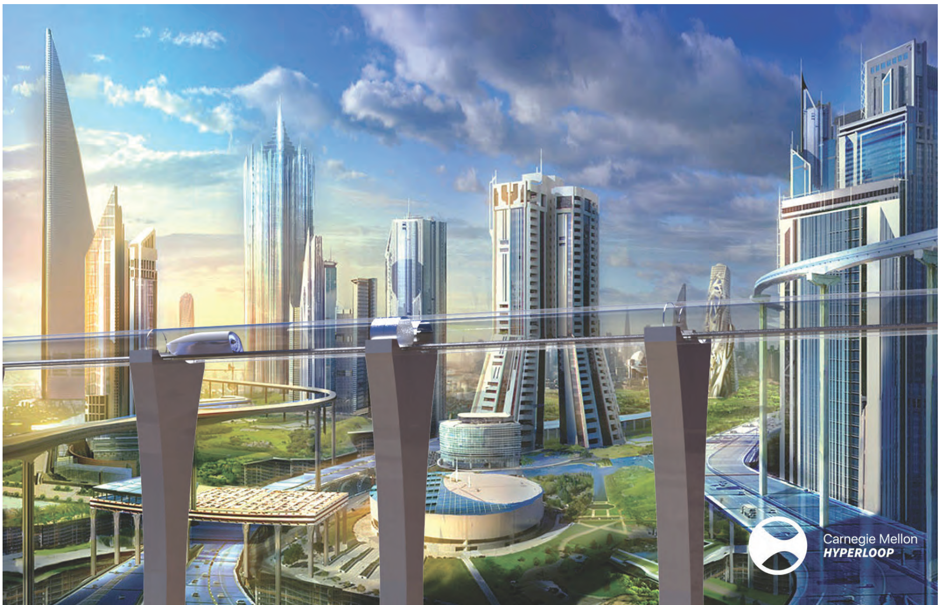
The Hyperloop, as envisioned by SpaceX CEO Elon Musk, would turn a six-hour road trip into a 30-minute commute.