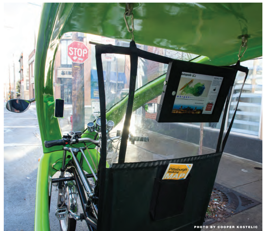
Passengers view video advertisements on an iPad.