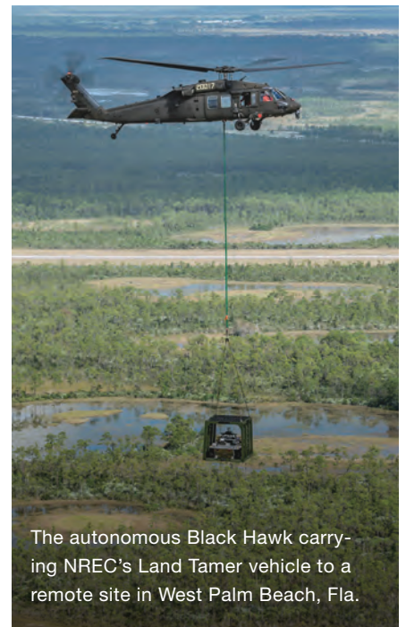
The autonomous Black Hawk carrying NREC's Land Tamer vehicle to a remote site in West Palm Beach, Fla.

NREC has extensive experience in unmanned ground vehicles, having developed the unmanned Crusher off-road vehicle for the Defense Advanced Research Projects Agency (DARPA), the Advanced Platform Demonstrator for TARDEC and a tactical unmanned ground vehicle, called Gladiator, for the U.S. Marines, as well as advanced off-road autonomous driving technology. NREC also was part of CMU's Tartan Racing Team that won the $2 million 2007 DARPA Urban Challenge robot race with its autonomous