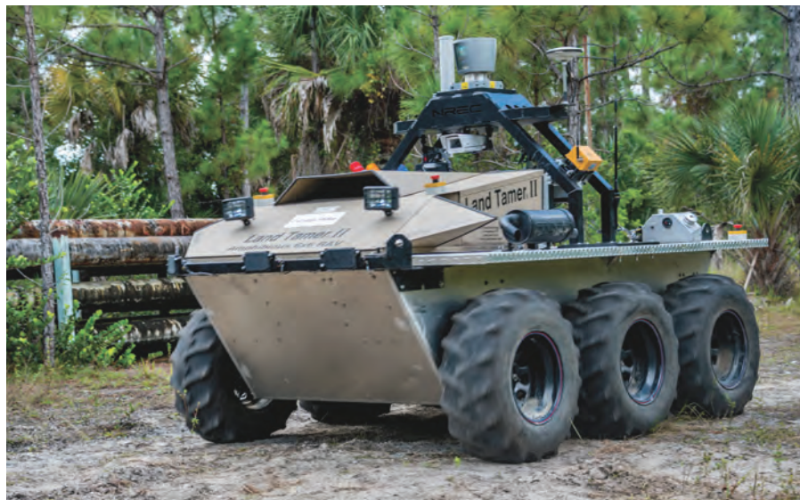
NREC's Land Tamer vehicle performed environmental sensing at a remote site as part of the demonstration.