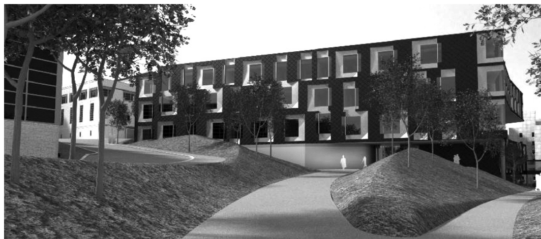
A FOUR-STORY STRUCTURE WILL SIT OFF FORBES AVENUE BETWEEN CYERT AND HAMBURG HALLS AND WILL CONNECT FROM ALL LEVELS TO A SEVEN-STORY, MULTIFACETED BUILDING NESTLED BETWEEN THE PURNELL CENTER, DOHERTY, NEWELL-SIMON AND SMITH HALLS, AND THE COLLABORATIVE INNOVATION CENTER.

That big challenge for Carnegie Mellon is the new $88.6 million Gates Complex for Computer Science, made possible with a $20 million lead gift from the Bill & Melinda Gates Foundation. The complex will consist of two buildings, totaling 210,000 square feet, and a 150-space underground parking garage on the western part of campus. A four-story, 50,000 square-foot structure