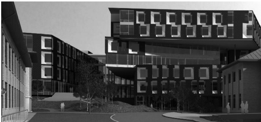
THE GATES COMPLEX, SHOWN HERE BETWEEN SMITH AND NEWELL-SIMON HALLS, WILL INCLUDE 310 PRIVATE OFFICES, 32 LABS, 11 CONFERENCE ROOMS AND A 250-SEAT AUDITORIUM.

Speaking of the Cut, a pedestrian bridge will connect the Gates Center to the Cut, some 80 feet above. Another pedestrian bridge will connect the Gates Center to Newell-Simon Hall.