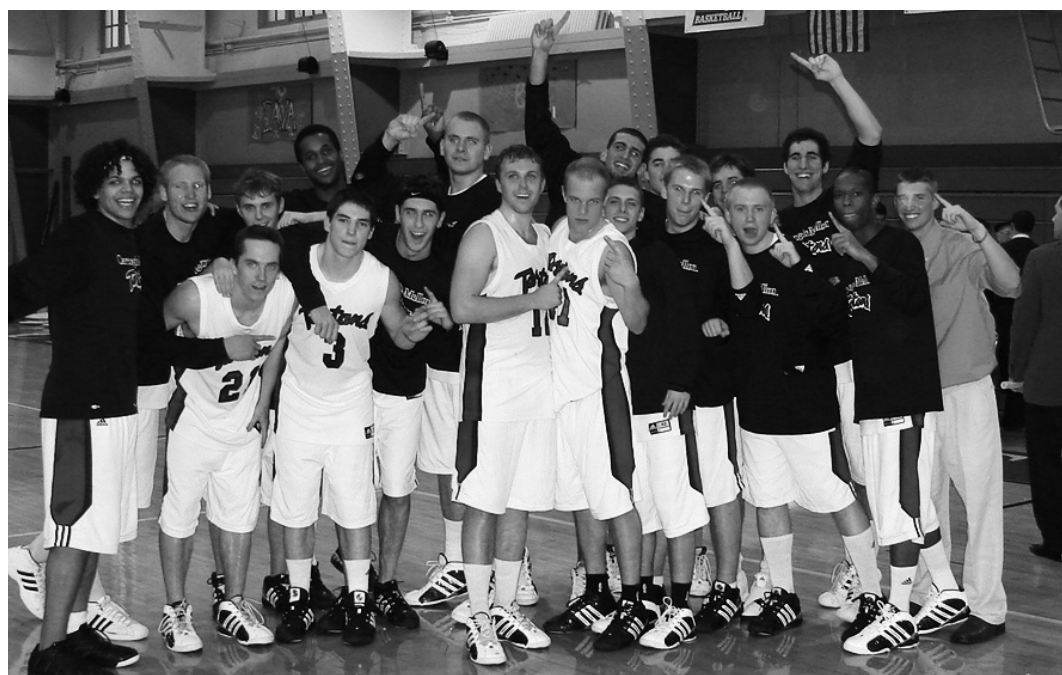
THE TARTANS, WHO WON THEIR FIRST UAA TITLE AND ADVANCED TO POST-SEASON PLAY LAST YEAR, WILL TAKE ON THE PITT PANTHERS NOV. 1.

The Tartans enter the contest with several returning members from last