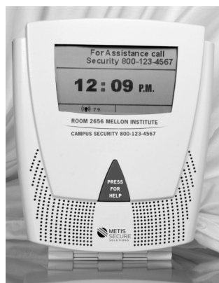
HCI STUDENTS DESIGNED A PROTOTYPE FOR THE METIS SECURE SOLUTIONS ALERT SYSTEM.