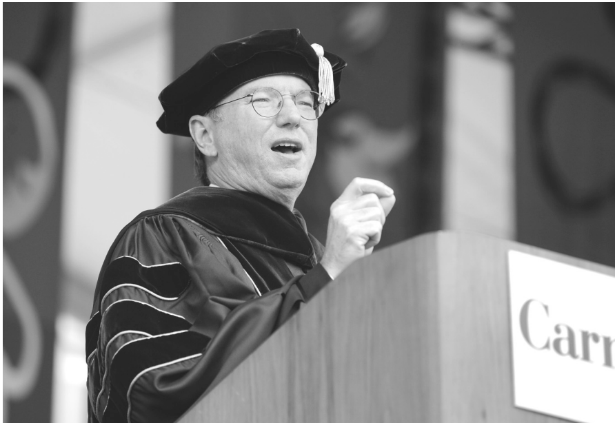
ERIC SCHMIDT COMPARED HOW TIMES HAVE CHANGED SINCE HE WAS IN COLLEGE.

So when I think about you all, I think about you as the Facebook and the Google generation, the first generation that really grew up with the Internet. When I grew up, you know, we had Tang, you had Red Bull. We used a program that was called basic, you all used Java. We had VCRs that held a half an hour of video that cost $700, and you all can upload 15 hours of