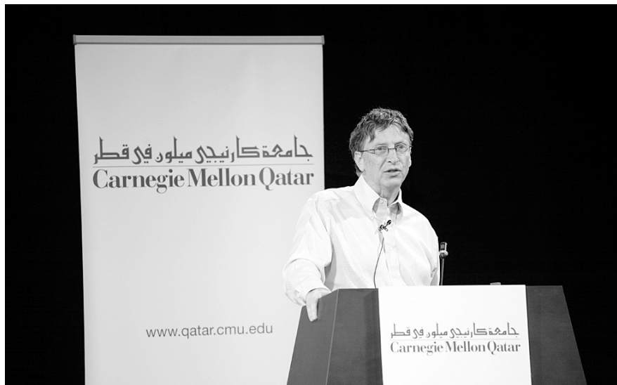
BILL GATES DELIVERED THE KEYNOTE ADDRESS FOR THE THIRD INTERNATIONAL CONFERENCE ON INFORMATION AND COMMUNICATION TECHNOLOGY AND DEVELOPMENT (ICTD2009) AT CARNEGIE MELLON UNIVERSITY IN QATAR.

"The conference expanded in several dimensions this year with the