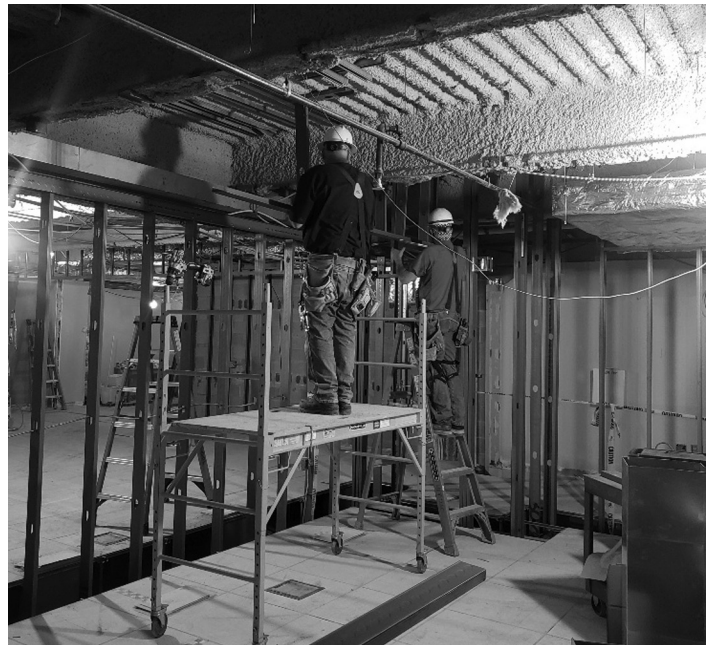
Construction is underway in our new space

We have been impressed with their spirit of cooperation and look forward to a productive working relationship with the Landau team over the coming months.