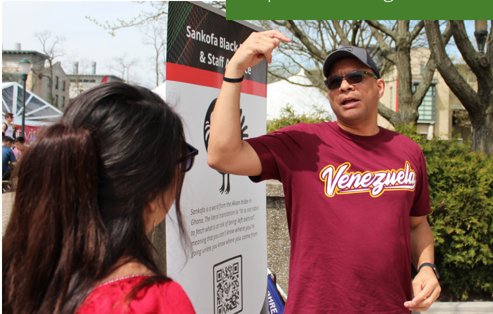
The LFSA ERG (and the other ERGs) took part in the Spring Carnival, April 14th, 2023.

Hispanic Heritage Month and the year ahead!