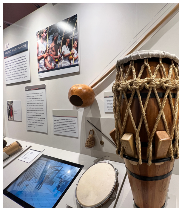
LACC displays included items from everyday life, traditional and musical instruments, each display grounded in history and highlighting the unique aspects of our respective cultures.