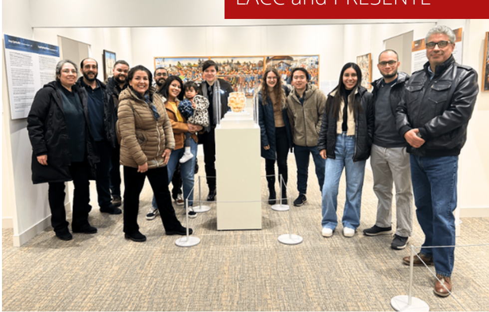
The Latine ERG visited the Latin American Cultural Center in Oakland. March, 2023.