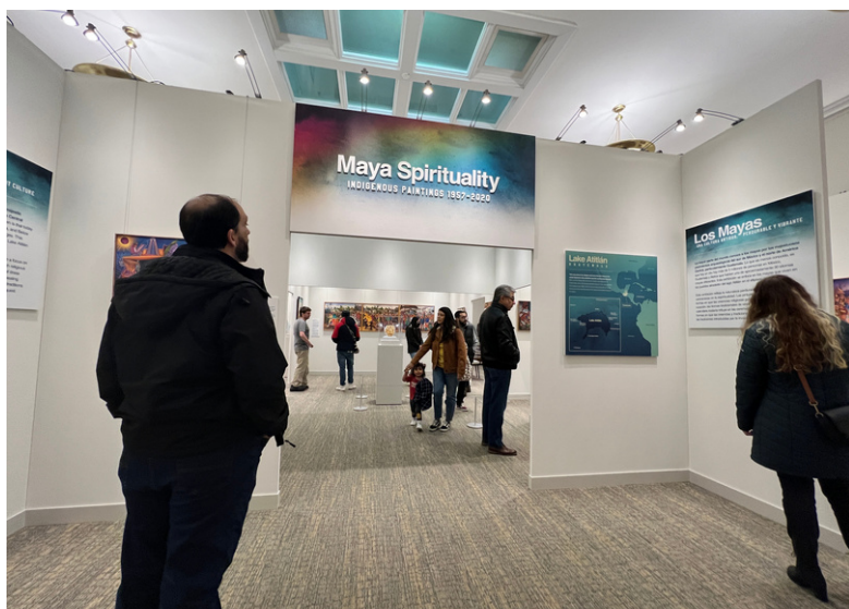
ERG members enjoyed beautifully designed displays telling the stories of Latin American and Caribbean life and history.

It is these paintings and objects that are included in this exhibit, introducing the rich and complicated spiritual life of the contemporary Maya.