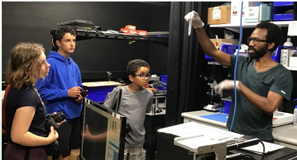
Students in Newell Simon Hall lab