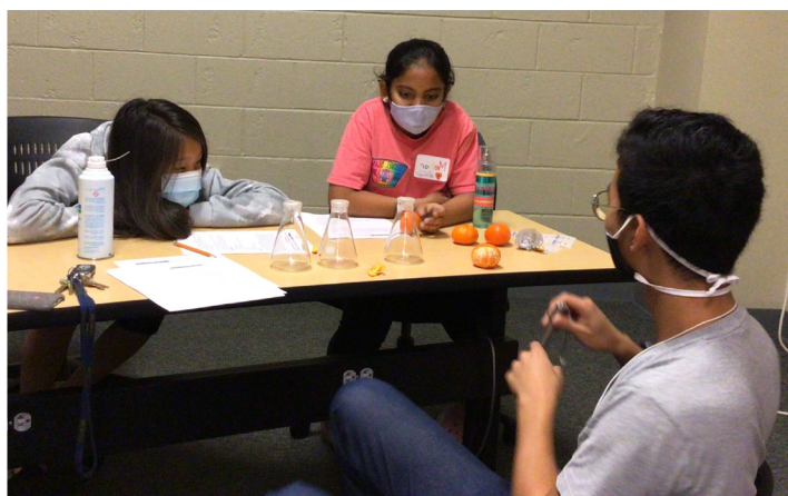
Students learn about soft robotics and prepare to create their own silicone digits (Above Left). Students examine small air particles to learn about smog and clouds (Above Right).