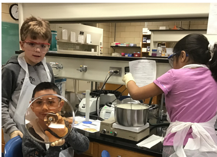
Above, students create hydrophobic art (left) and conduct an experiment in the chemistry lab at Mellon Institute (right).