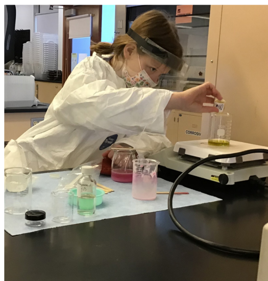
Students participating in hands-on STEM activities in Gelfand Outreach workshops.