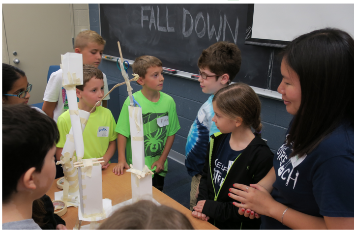
A CMU student instructs the hands-on Gelfand Outreach class, "Why Things Fall Down".