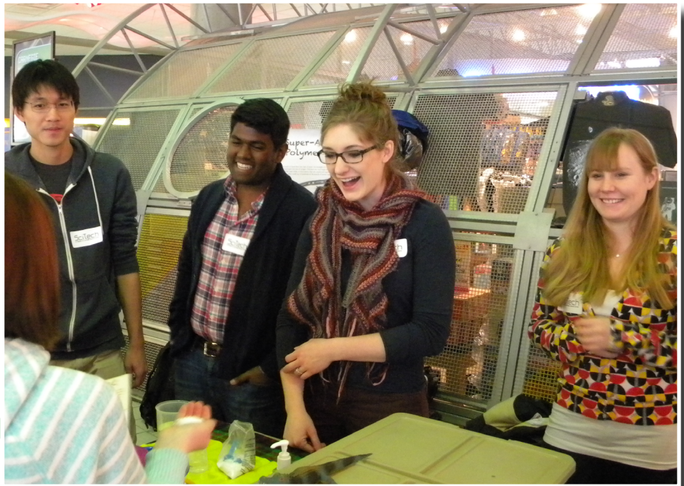
CMU students present with the Leonard Gelfand Center at the Carnegie Science Center during SciTech Days.

The Leonard Gelfand Center for Service Learning & Outreach supports activities that enable Carnegie Mellon students, faculty and staff to use their energy and expertise to improve the quality of life, motivate learners of all ages, and solve problems in the community. We facilitate partnership development with individuals, school districts and organizations in Pennsylvania and beyond to design and implement programs and service learning course activities. STEM education outreach programs are our priority.