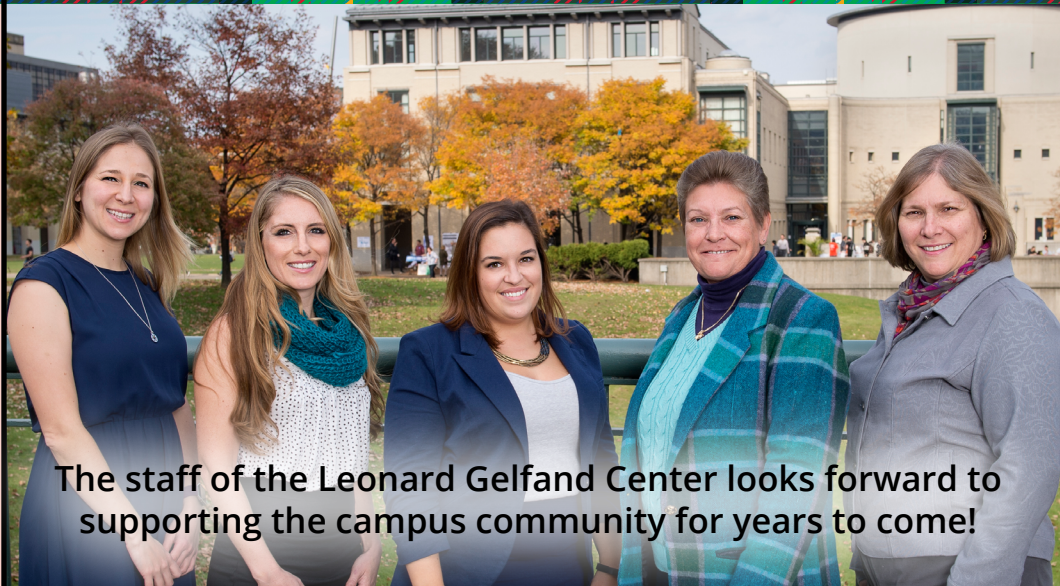
The staff of the Leonard Gelfand Center looks forward to supporting the campus community for years to come!

Focused on sharing information about Carnegie Mellon research with a wide-ranging K-12 audience and building on decades of successful programs such as Bridges, C-MITES and Road to Research, Gelfand Outreach (GO) programs began in January of 2015. GO offers dozens of Saturday STEM workshops each fall and spring along with week-long classes in the summer!