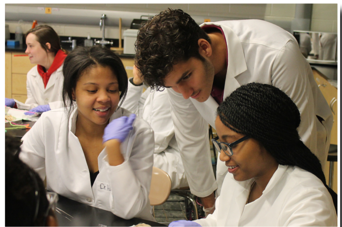
A Leonard Gelfand Center tutor interacts with students during an in-class lesson at Pittsburgh Science and Technology Academy.