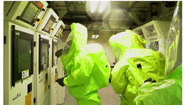
Members of EHS and HAZMAT containing the release of gases during the drill

Members of the university's emergency preparedness and response team conducted its second annual emergency response drill on November 5, 2019. The purpose of the drill was to exercise the university's emergency response protocols, including coordination with external agencies. The drill simulated a hazardous materials release at the LL212 Nanofabrication Laboratory - Process Equipment Room at Scott Hall.