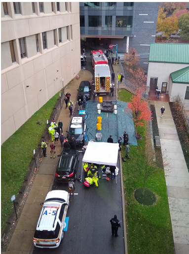
Pittsburgh Bureau of Fire HAZMAT Drill de-contamination area