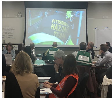
Members of the Emergency Preparedness and Response Team watch as HAZMAT Team arrives on the scene at Scott Hall during the drill