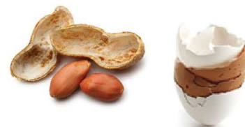
EGG AND NUT SHELLS