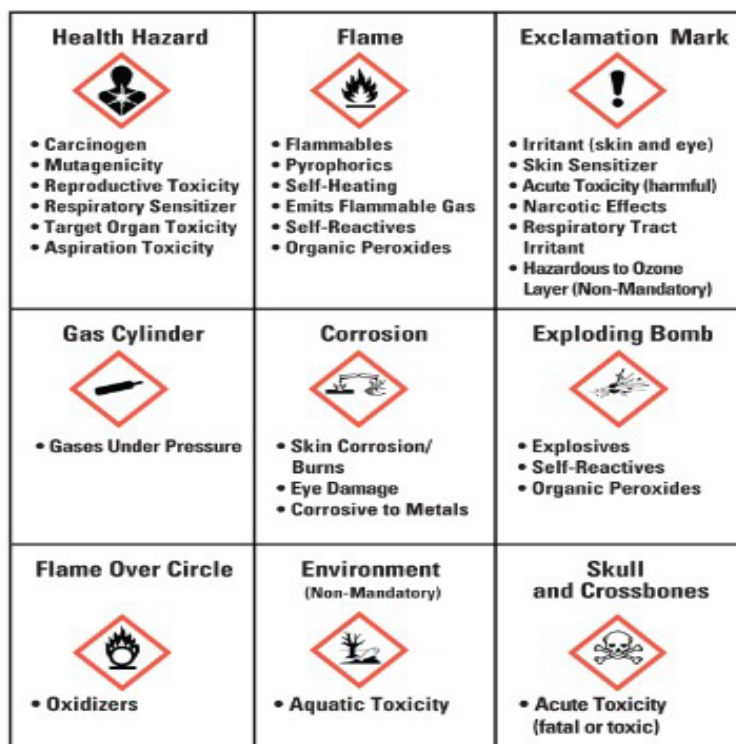
Figure 1: Pictograms and Hazards

The university requires the pictograms to be present on chemical labels, including on secondary containers. Figure 1 identifies the pictograms: