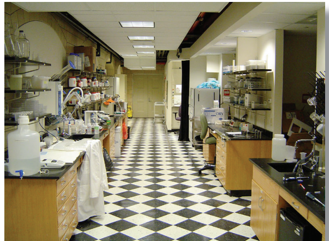
The Great Hall of Brain Science, 1st floor, Mellon Institute